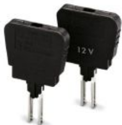
Fuse plug, nominal current: 6.3 A, length: 33.1 mm, width: 6.1 mm, height: 45.7 mm, color: black

Please be informed that the data shown in this PDF Document is generated from our Online Catalog. Please find the complete data in the user's documentation. Our General Terms of Use for Downloads are valid ( http://phoenixcontact.com/download )